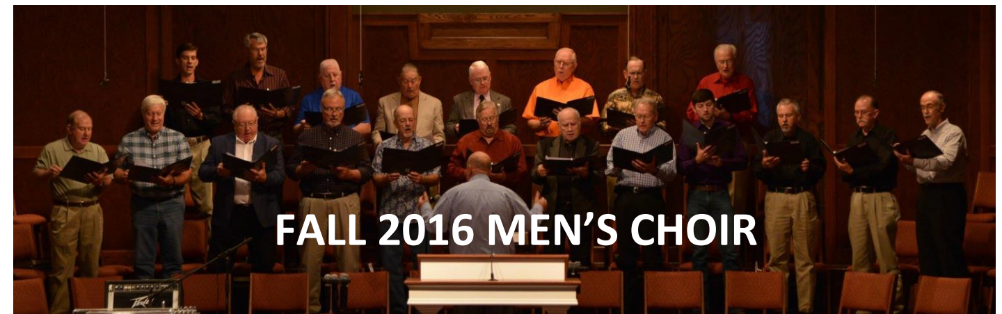
FALL 2016 MEN'S CHOIR