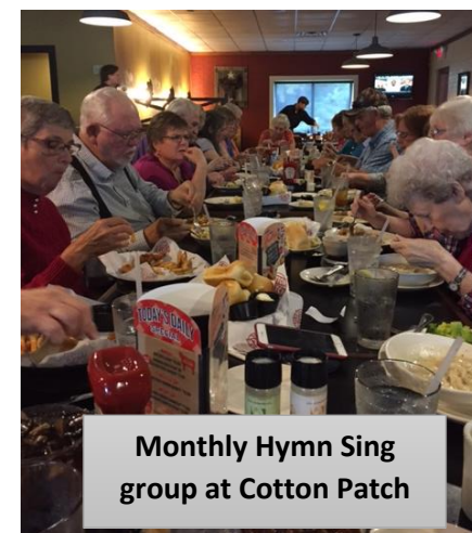
Monthly Hymn Sing group at Cotton Patch